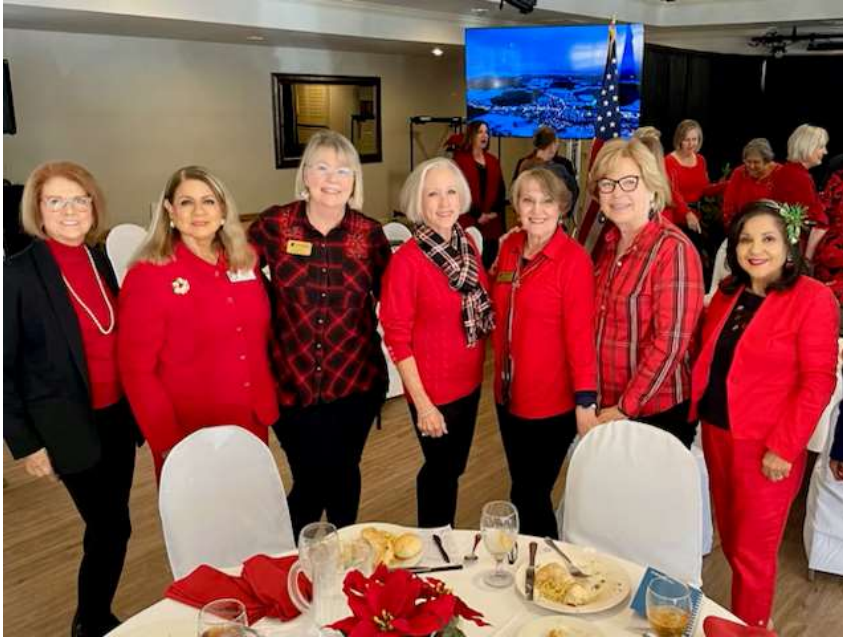
SARW attended the Greater San Antonio Council of TFRW Christmas Luncheon at Anne Marie's