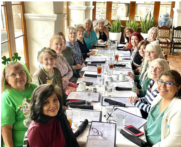
CHAT (Chicks Having an Awesome Time) gathered at La Fonda and enjoyed good food, fellowship and door prizes!